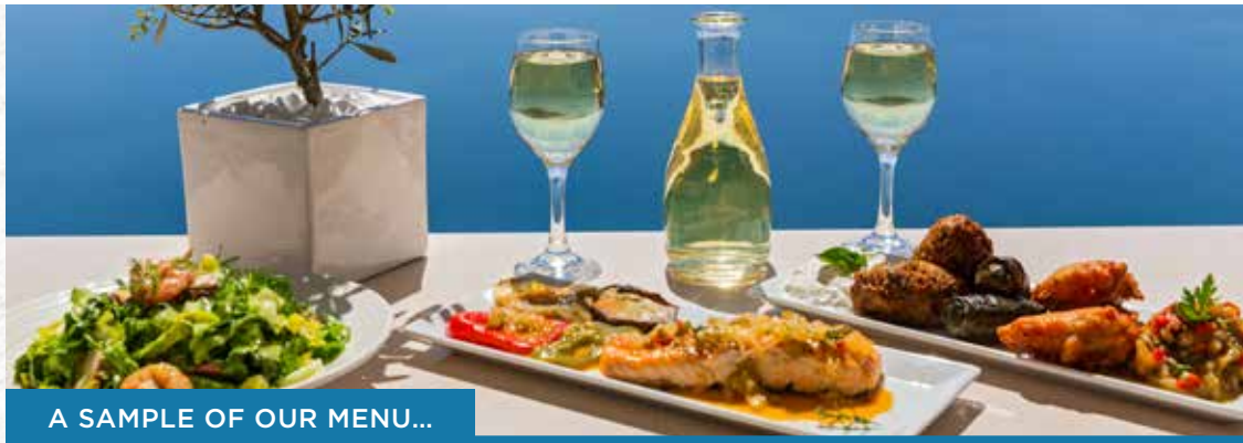
A SAMPLE OF OUR MENU...